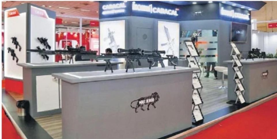
Hyderabad-based CARACAL-ICOMM displayed combat pistols, sub-machine guns, rifles and sniper rifles at Milipol from October 26 to 28 in New Delhi