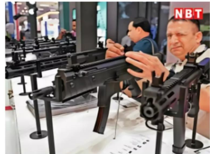
प्रगति मैदान में लगा हथियारों का मेला

ट्रेड फेयर से पहले प्रगति मैदान में सिक्योरिटी फेयर का आगारा किया गया है। 26 अक्टूबर से शुरू हुए इस फेयर में एक से बढ़कर एक हथियार देखने को मिल रहे हैं। इस फेयर में हथियारों के साथ ही एक आधुनिक कार भी लैबल है। जो हथियारों से भुल लेस है।